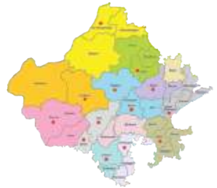
Handholding support provided through Onsite Trainings by CPSD, CRC (Year 2017-18)

Website: www.childprotectionsupportdesk.org